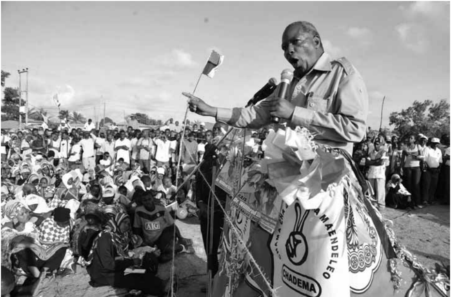
Dr Slaa addresses a crowd in Zanzibar