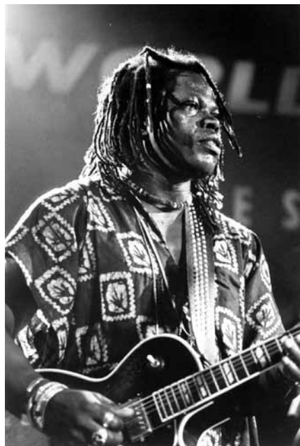
At WOMAD in 1989