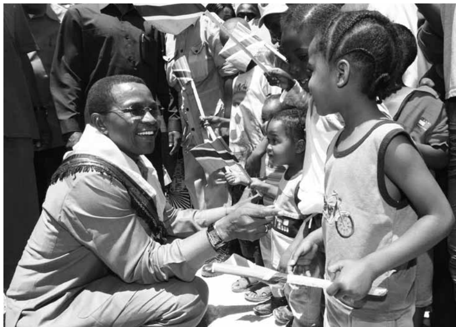
President Kikwete on the campaign trail in Dodoma