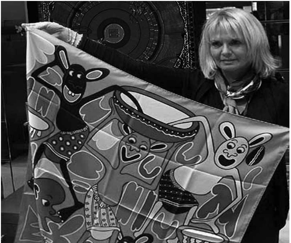
Hermes scarf with Lilanga design at Paris airport

As a sign that the “tinga tinga” style has become an internationally accepted art style, Hermes of Paris have brought out one of their famous silk scarves screen printed with a design by the late George Lilanga. Lilanga’s work has been displayed outside Africa since the late seventies, at the Mary Knoll Ossining Centre in New York in 1978 and in a 1985 travelling exhibition that stopped in Austria, Denmark, Finland, Norway and Sweden. He also took part in the landmark “Africa Remix” road show which passed through Europe, Japan and Houston in 2004-2006.