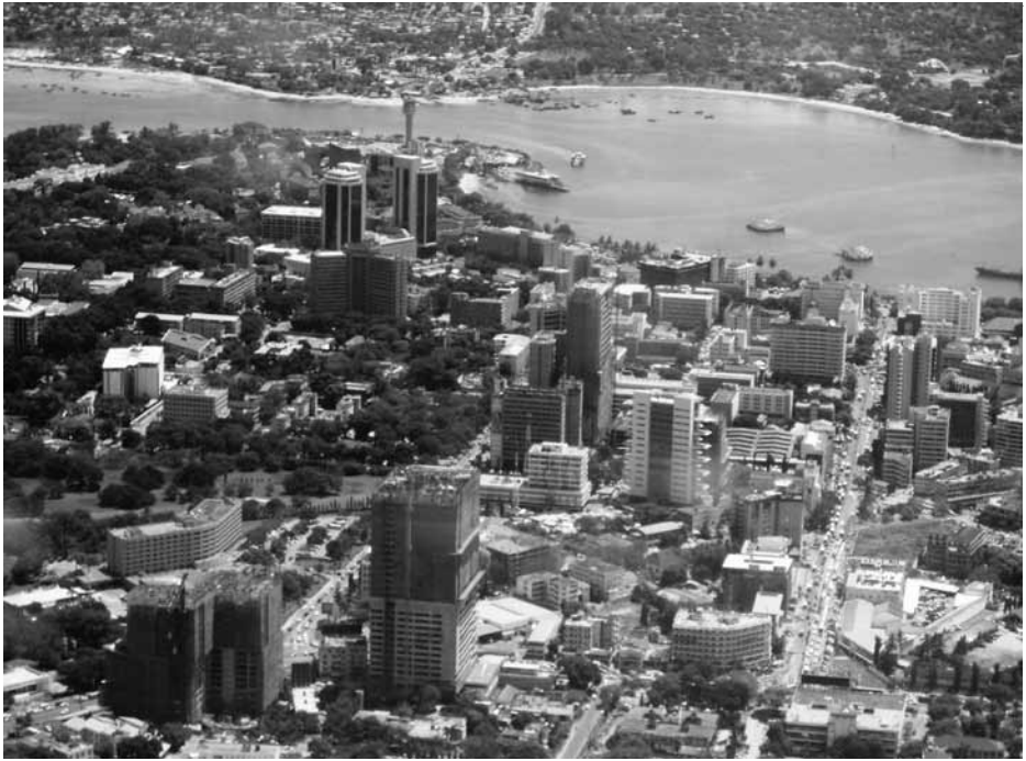
Kivukoni area of Dar-es-Salaam, with the Askari Monument to the right, and the Bank of Tanzania twin towers in the distance, near the ferry to Kigamboni.

tracks alongside the routes with the aim of encouraging non-motorised transport in the city. Funding for the project comes from the World Bank and UNEP as well as the Tanzanian government.